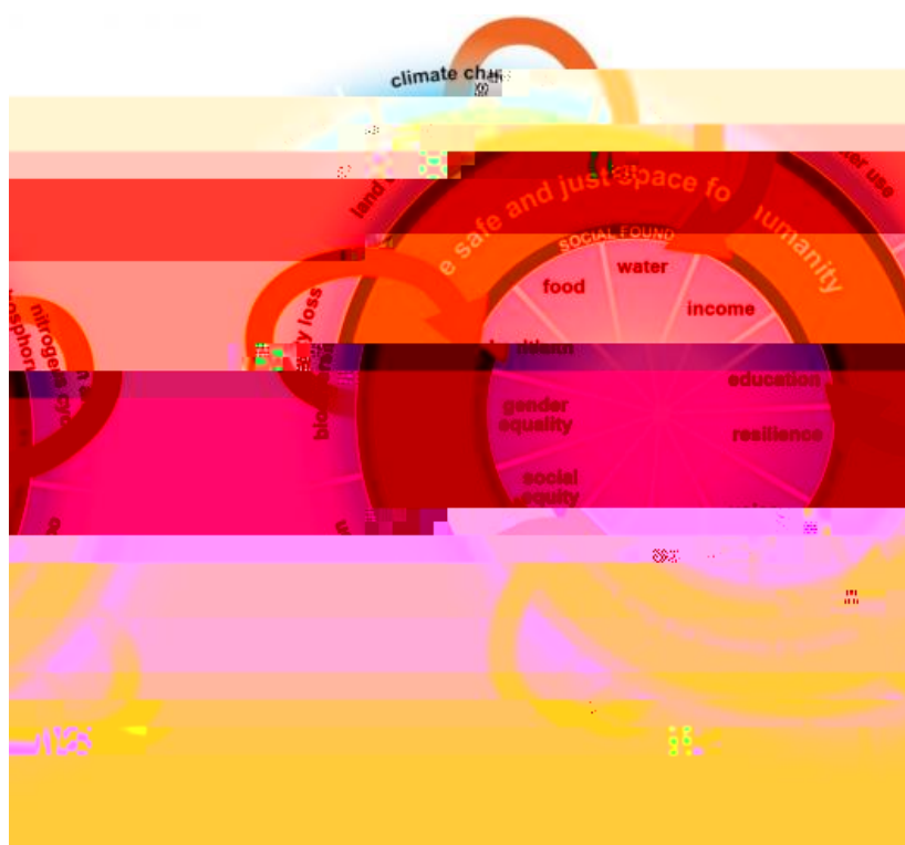
FIGURE 1: FROM KATE RAWORTH, OXFAM, HTTP://WWW.SLIDESHARE.NET/STEPSCENTRE/KATE-RAWORTH-CAN-WE-CREATE-A-SAFE-AND-JUST-SPACE-FOR-HUMANITY

Still thinking about the story they shared, ask people to think about the positive impacts that were made by the story they shared, and to write each impact on a green post-it note. Once done, ask them to place their post-its into the donut in the appropriate section and to move on into the coffee break. Tell people that if none of the donut sections seem appropriate, they can also add a new section on the side of the donut and place their post-its there.